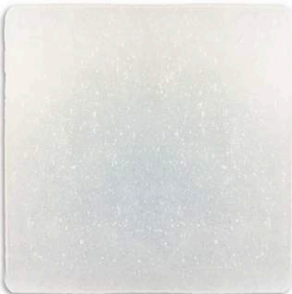
Seeded Opal KFG