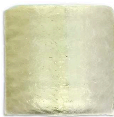
Pale Gold CG