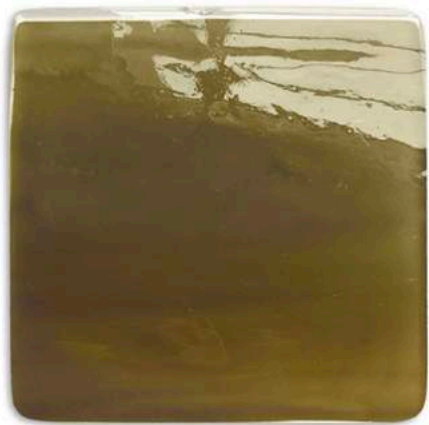
Nile Green MBG