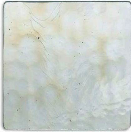
Opal White KFG