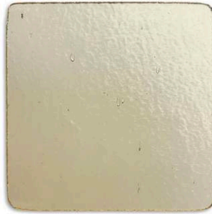
Pale Gold KFG