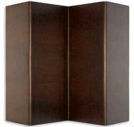
Japanesque (Gear, Core & Momo)