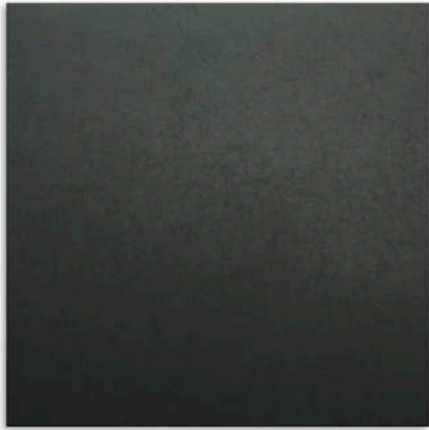
Deep Black Oxide