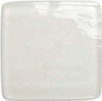
Opal White MBG