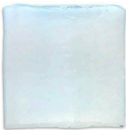
Opal White CG