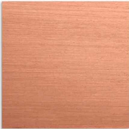
Natural Copper (Beam)