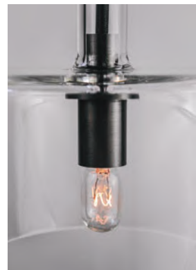
MADISON PENDANT 12