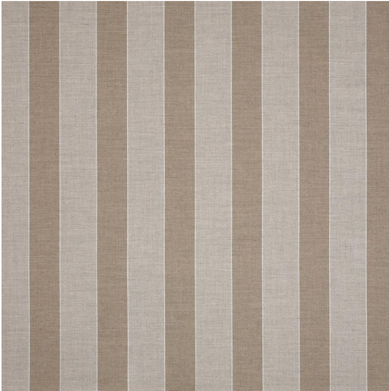
COLOR: STONE - 01

NOTE: STIPES ARE NOT SAME WIDTH, LIGHT COLOR 2.5" DARK COLOR 2.125"