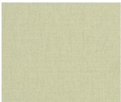
COLOR: SPRING - 05