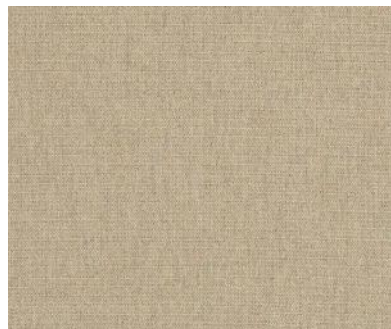
COLOR: ASH - 02