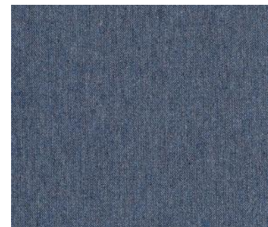
COLOR: JEAN - 10