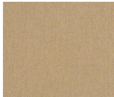
COLOR: CAMEL - 03