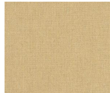
COLOR: STRAW - 04