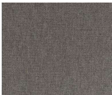
COLOR: - GREY - 11