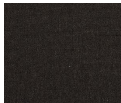
COLOR: COAL - 12