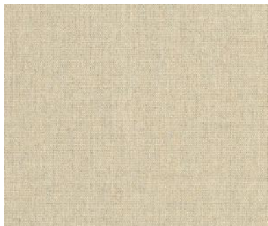
COLOR: NATURAL - 01