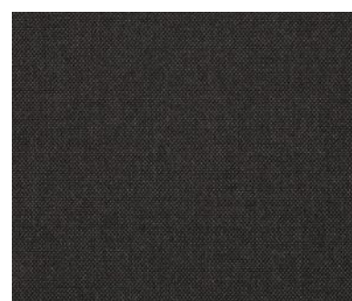
COLOR: OBSIDEON - 11