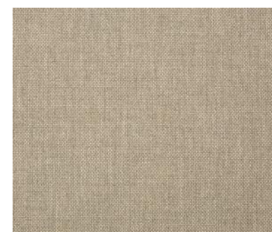
COLOR: COSMO - 08