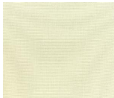
COLOR: CREAM - 03