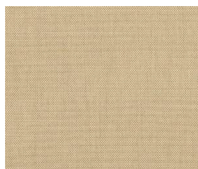
COLOR: CAMEL - 06