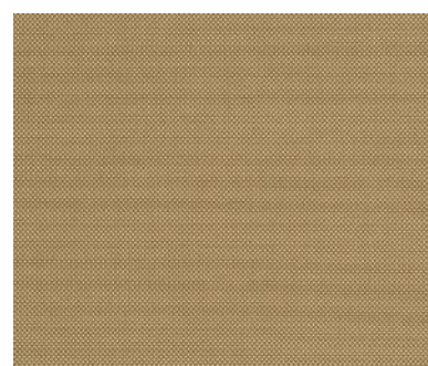
COLOR: LION - 07