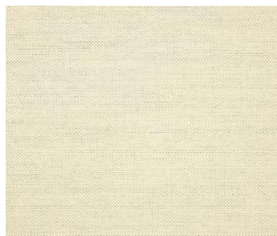
COLOR: MOON - 02