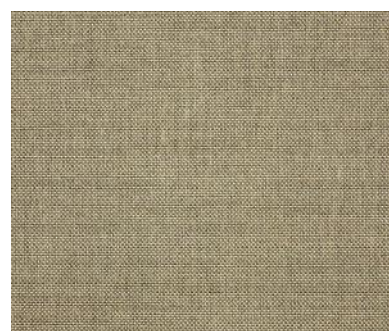
COLOR: ECHO - 09