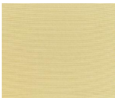
COLOR: WHEAT - 05