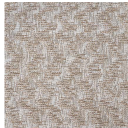
COLOR: KHAKI - 03