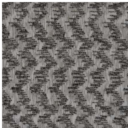
COLOR: OREO - 01