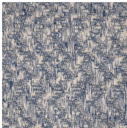
COLOR: DODGER - 05