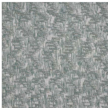
COLOR: SAGE - 04