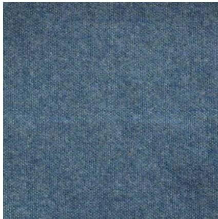
COLOR: BLUE JEAN - 05