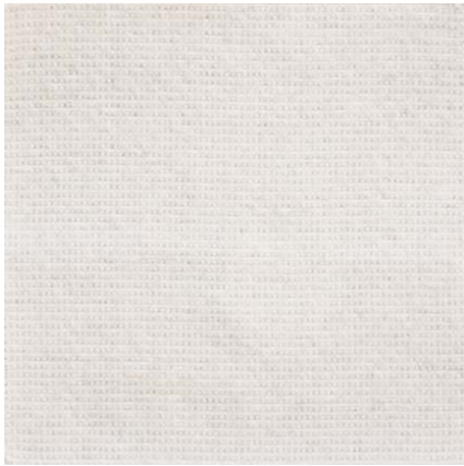
COLOR: WHITE - 01