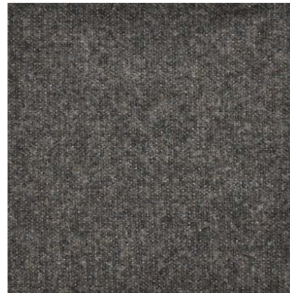
COLOR: DOBIE - 07