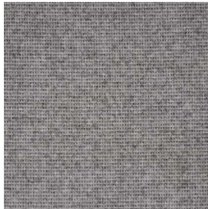
COLOR: GREY - 06