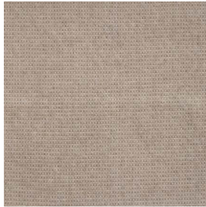
COLOR: PERU - 02