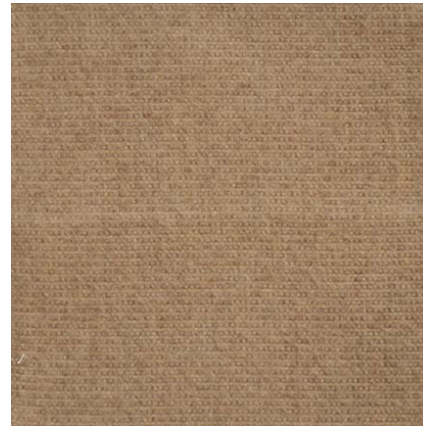
COLOR: CAMEL - 03