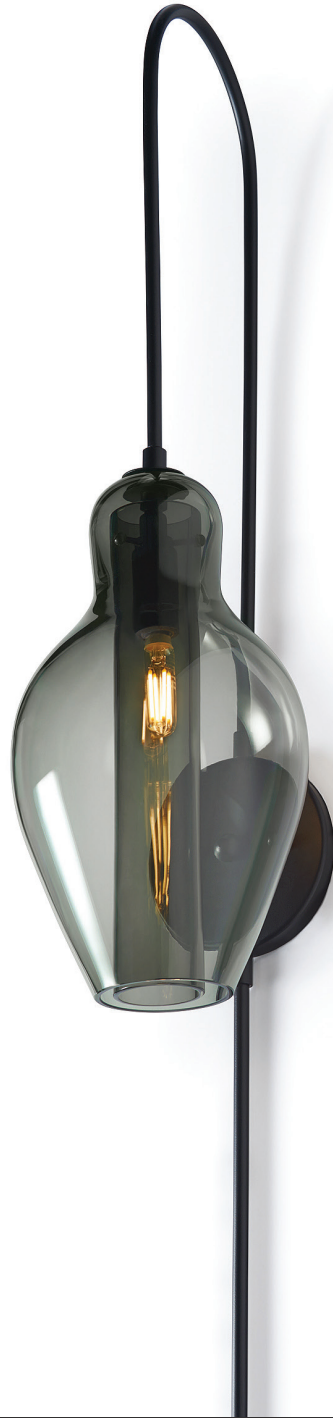
Cloche Wall Sconce