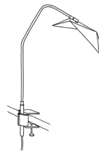
CLAMP LIGHT 6062 CL