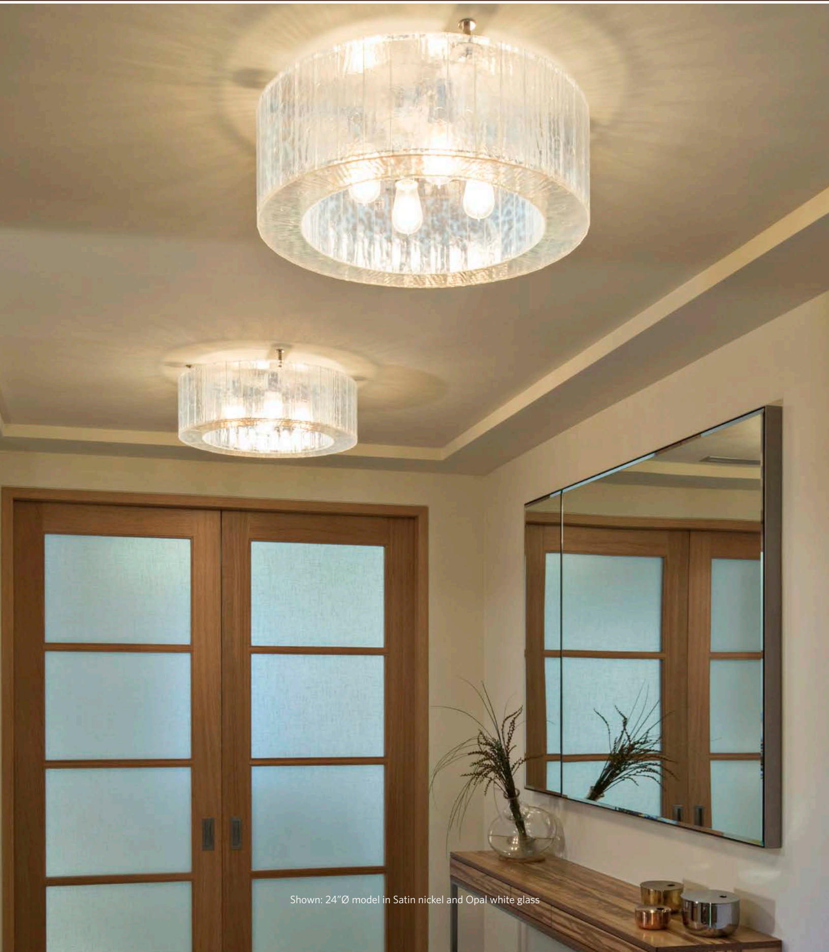
Shown: 24"Ø model in Satin nickel and Opal white glass