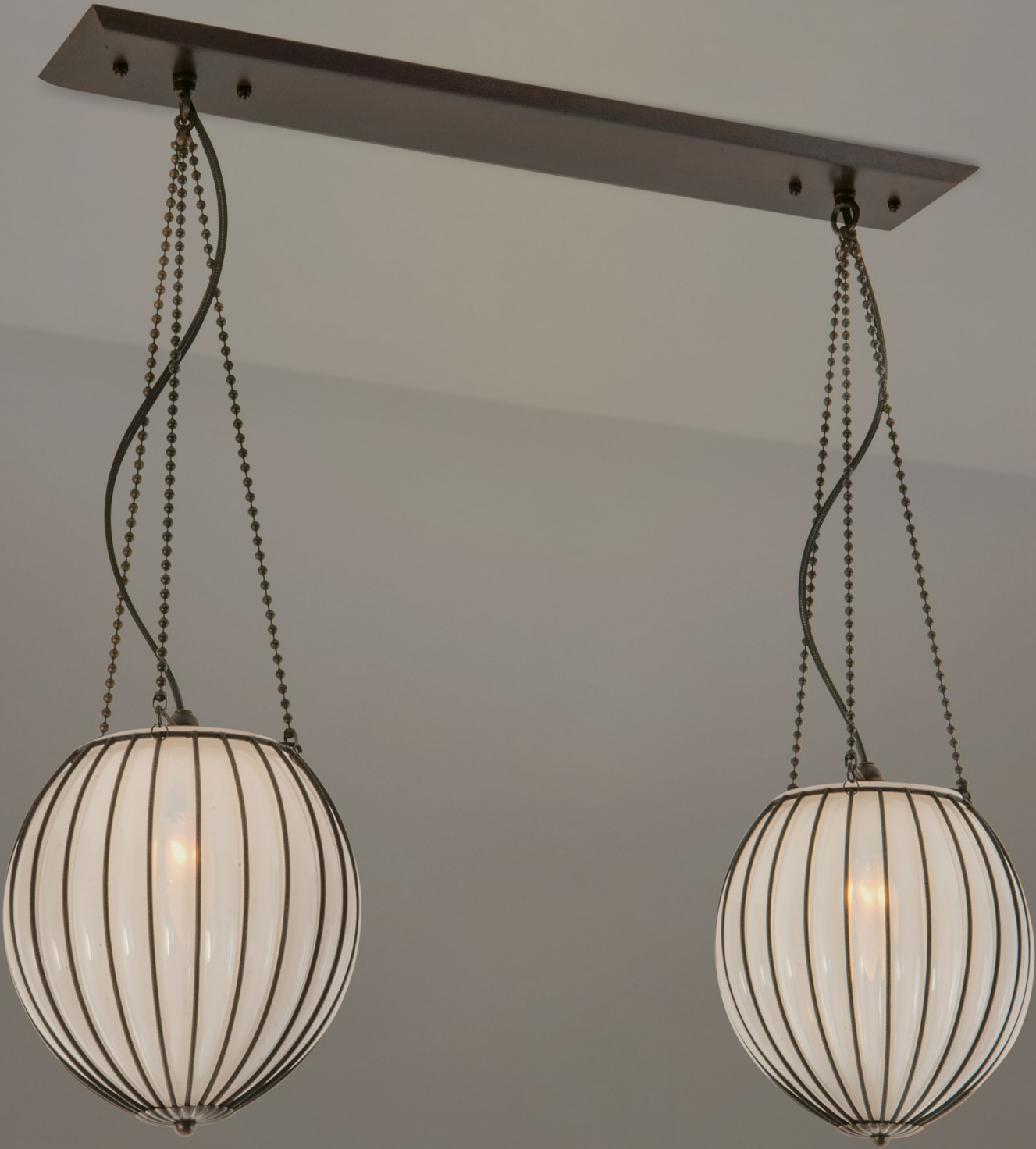
Shown: 8"Ø model in Opal white glass.