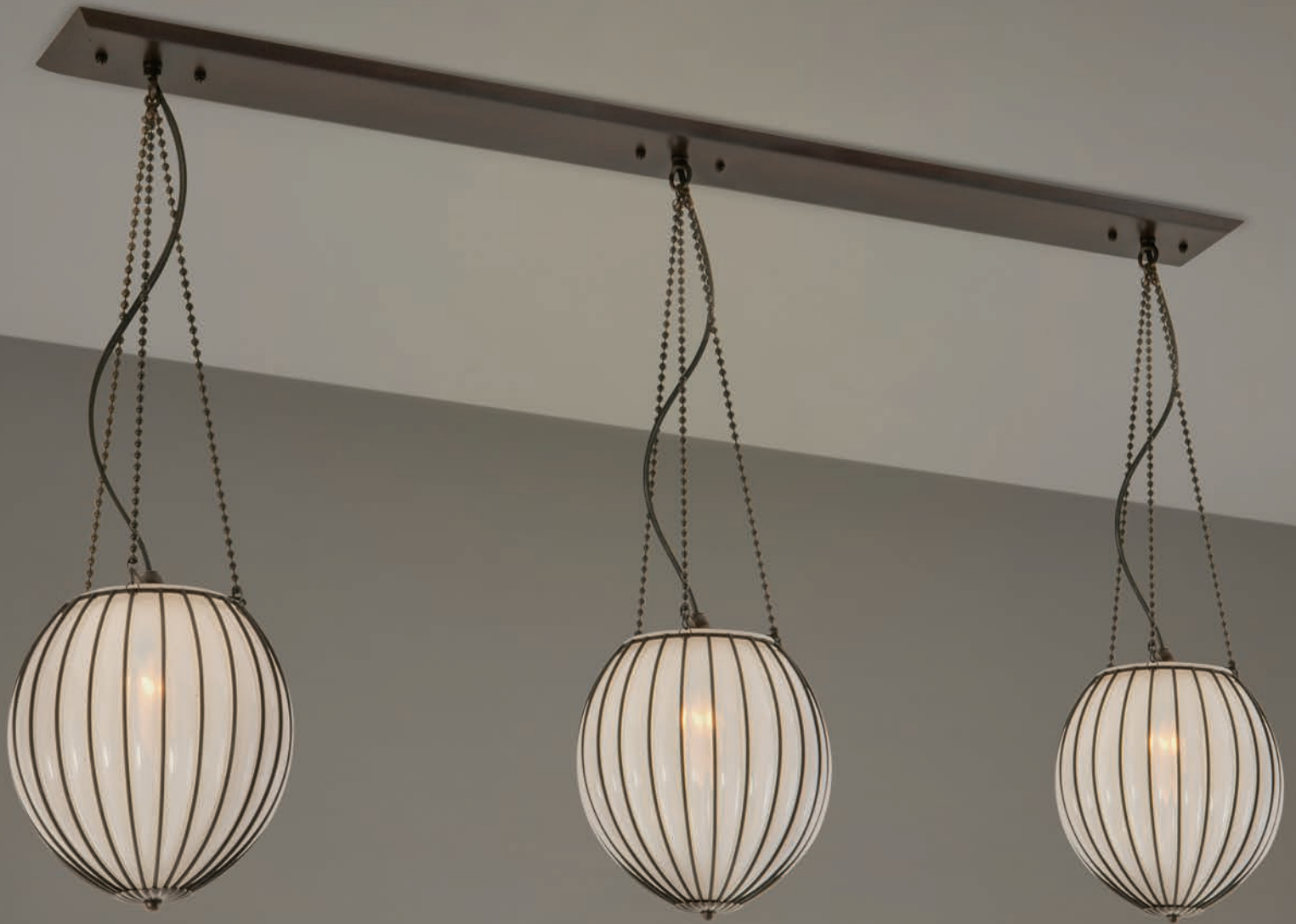
Shown: 8"Ø model in Opal white glass.