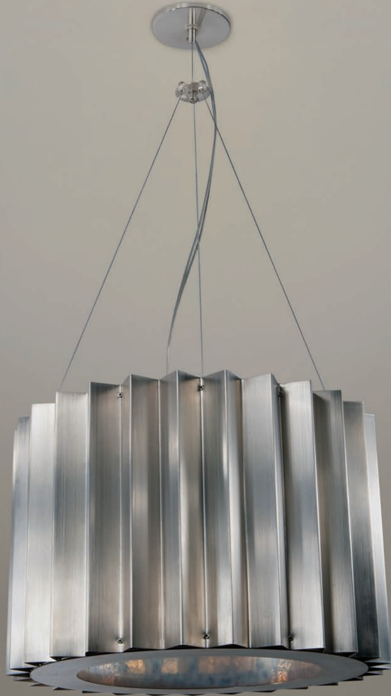
Shown: Satin nickel and Opal white glass.