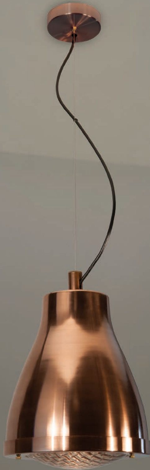
Shown: Natural copper with cable suspension.