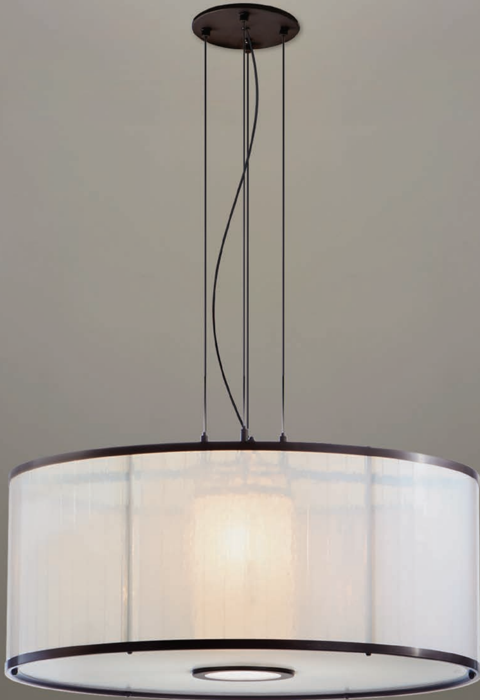
Shown: 24"Ø model in Deep brown oxide and Seeded opal glass, with cable suspension.