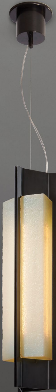
Shown: 22" model in Deep black oxide with Opal white cast glass.