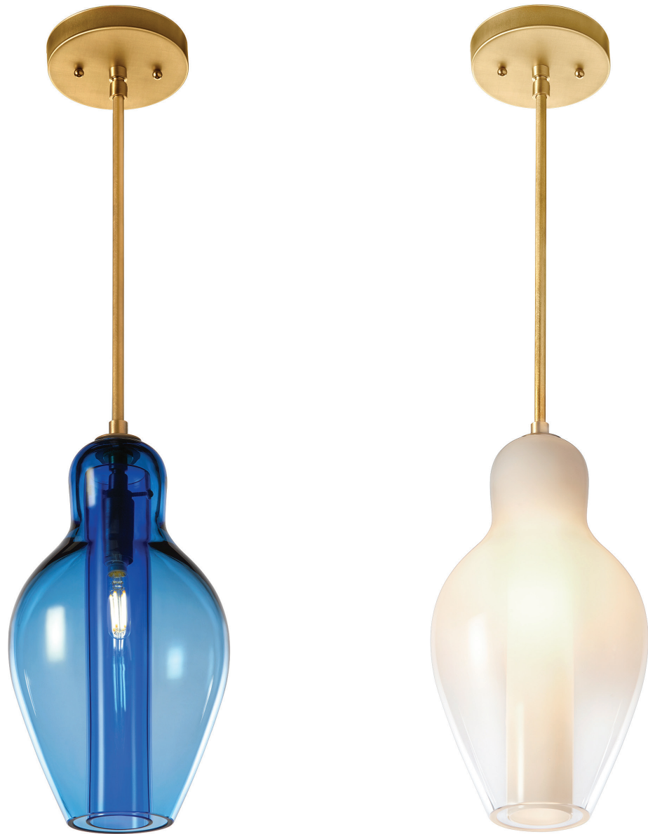
Cloches Insert Pendants