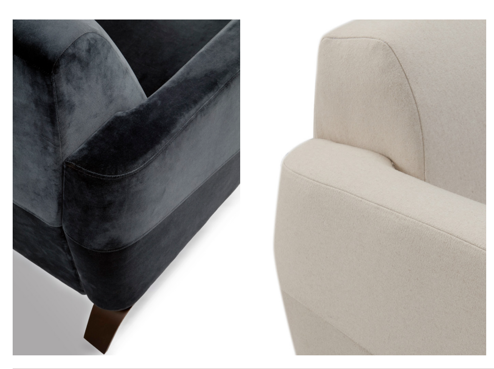
NOTES: PLEASE CONFIRM DETAILS OF THIS TEAR SHEET WITH YOUR LOCAL SALES ASSOCIATE.

Alexander Purcell Rodrigues Design reserves the right to make technological and aesthetic improvements to its models, including changes to the sizes and materials, without notice. The technical drawings do not define the details of the product. The measurements shown are indicative and may undergo changes. In particular, the dimensions relevant to the padded parts are subject to usage tolerances over time caused by the normal adjustment of the padding. For specific information, please contact us directly or the dealer closest to you.