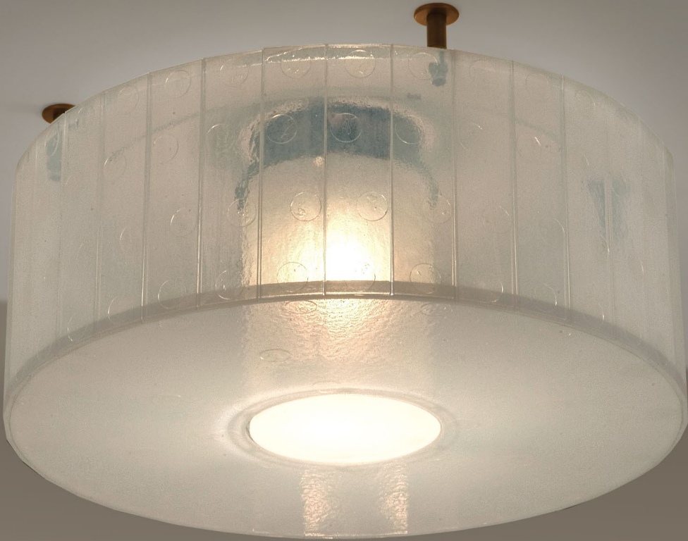
Shown: 18"Ø model in Deep brown oxide with Seeded opal glass.