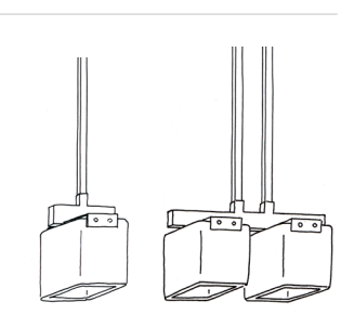
SINGLE PENDANT 4058A