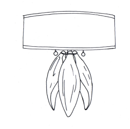
TABLE LAMP 6023