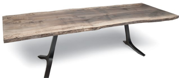
Oxidized Big Leaf Maple Finish and Blackened Steel Wishbone Base

* All TVM pieces are made to order, so custom configurations and sizing are encouraged. We work with maple, walnut and oak.