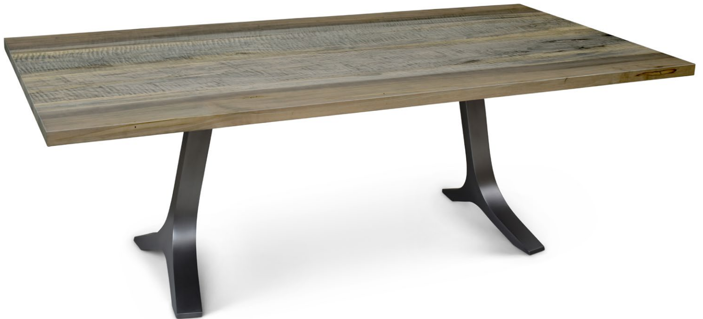
WISHBONE SLAB TABLE