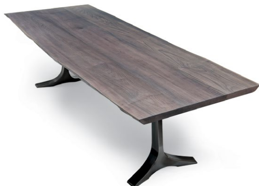
Maple in Rose Gray Finish and Blackened Steel Wishbone Base