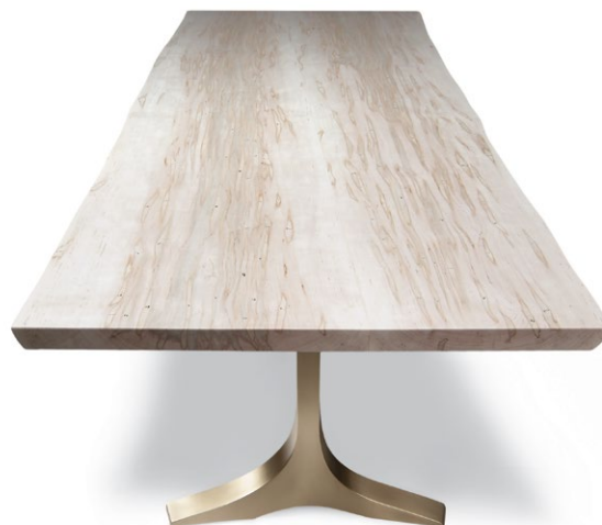
Ambrosia Maple Finish with Brass Wishbone Base