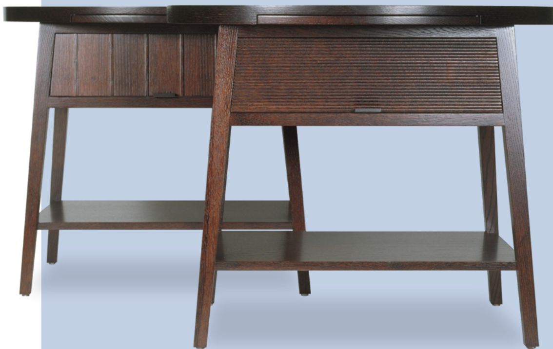
St. Lazare Night Table