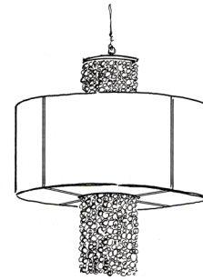
ROUND CHANDELIER 5009