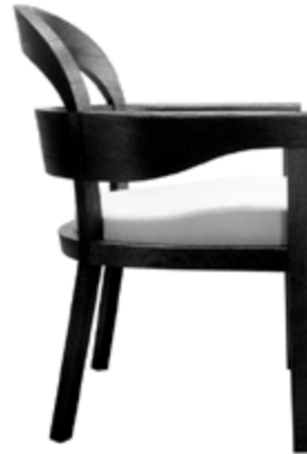
SHOWN Wood : Sandblasted Oak / Espresso