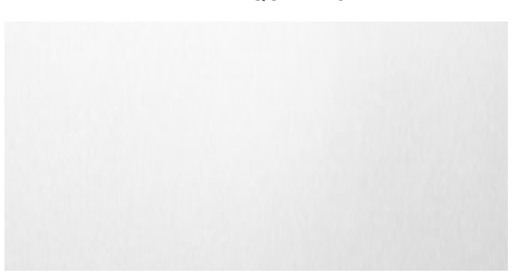
CLEAR FROSTED GLASS