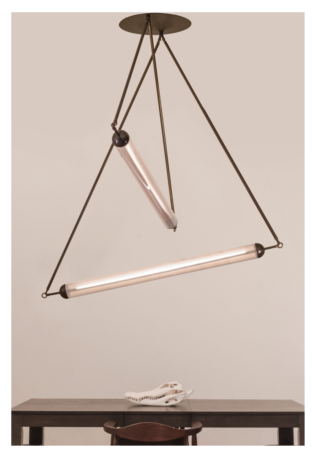
GLOSS ANTIQUE BRONZE CLEAR FROSTED GLASS