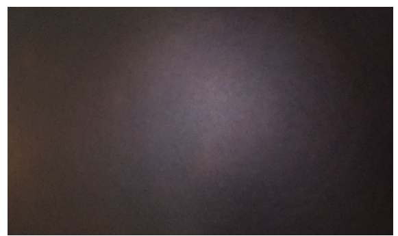
MATTE ANTIQUE BRONZE

CONTACT INFO@HILLIARDLAMPS.COM FOR CUSTOM REQUESTS