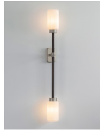
SATIN NICKEL & DARK BRONZE