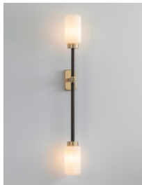
BRUSHED BRASS & DARK BRONZE