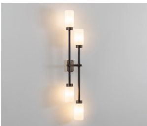
DARK BRONZE | LEFT