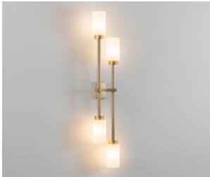
BRUSHED BRASS | LEFT