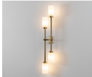
ANTIQUE BRASS | RIGHT