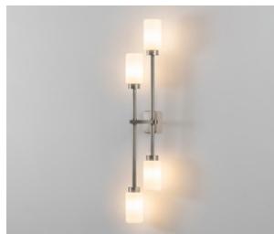
SATIN NICKEL | RIGHT