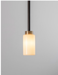
BRUSHED BRASS & DARK BRONZE