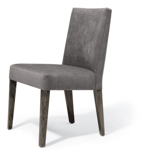
Corinne Side Chair