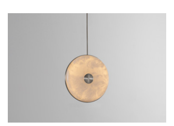
SATIN NICKEL | LARGE