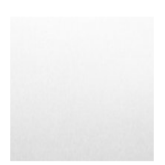
CLEAR FROSTED GLASS