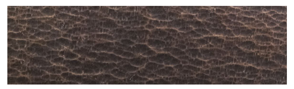
INTERIOR OF PENDANT: HAMMERED ANTIQUE BRONZE