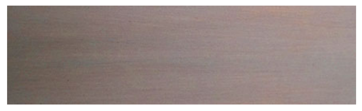
EXTERIOR OF PENDANT: BRUSHED ANTIQUE BRONZE