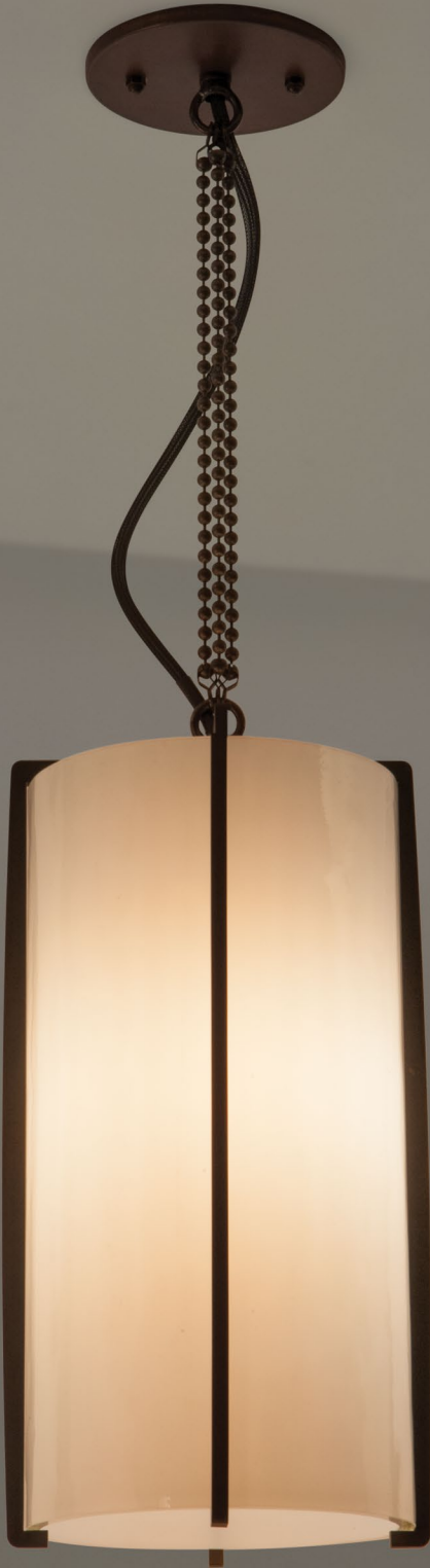
Shown: 6.75"Ø model in Deep brown oxide and Helbeige glass, with ball chain suspension.