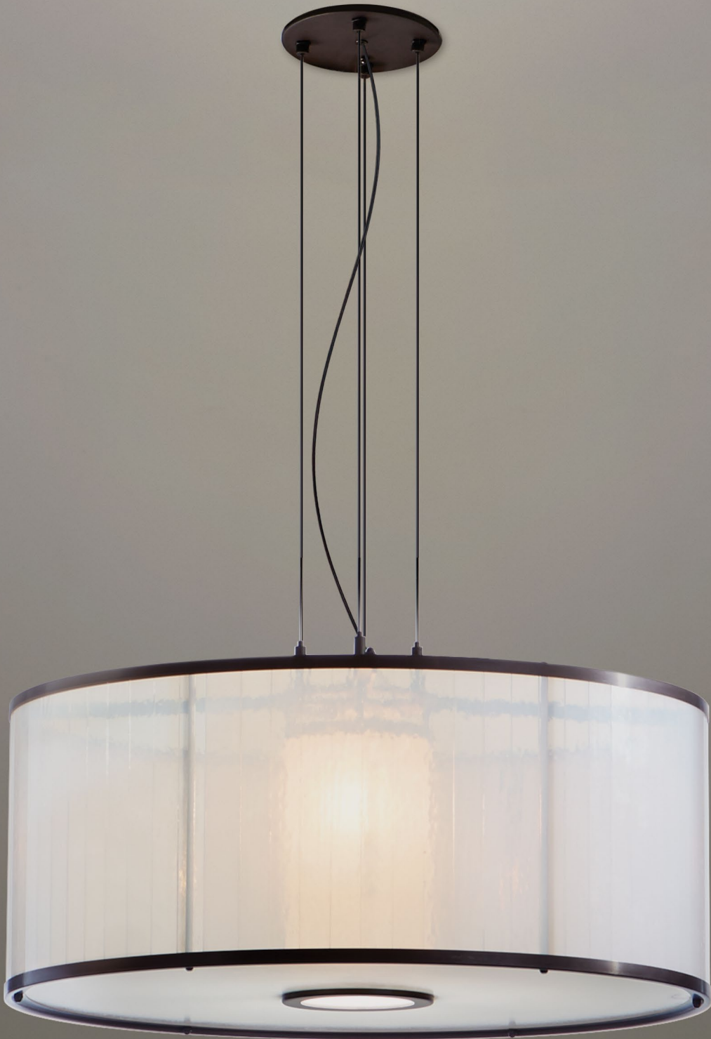
Shown: 24"Ø model in Deep brown oxide and Seeded opal glass, with cable suspension.