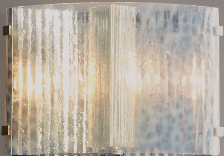
Shown: Satin nickel and Opal white glass with silver reflectors.