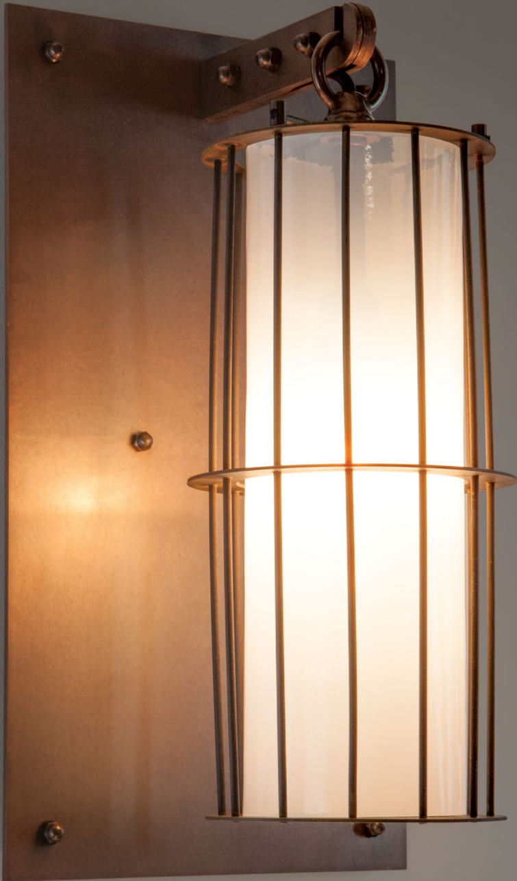
Shown: 5" model in Deep brown oxide and Opal white glass.