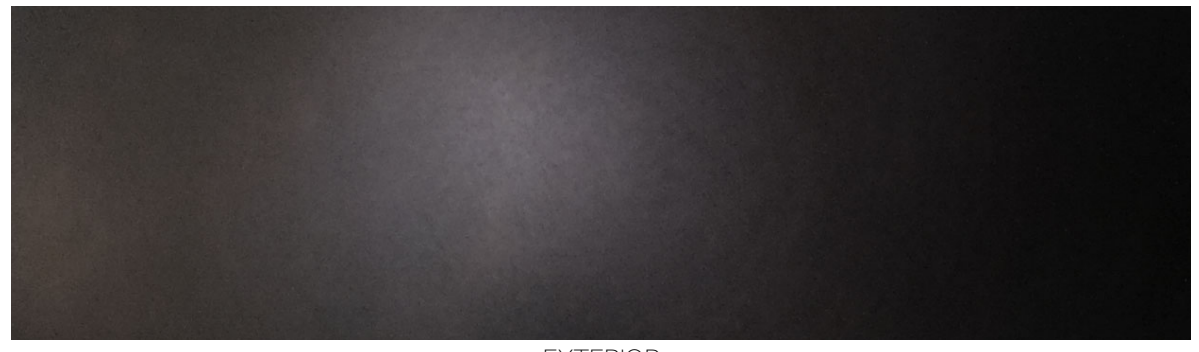
EXTERIOR MATTE ANTIQUE BRONZE